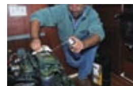
RIGHT: WD40 wards off condensation