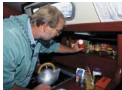
ABOVE: Take home all food stores (cardboard and tin) that may dissolve or rust