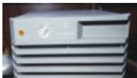
RIGHT: A dehumidifier draining directly into the sink will combat damp