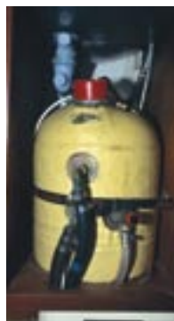
ABOVE: Grease battery terminals and drain watertanks and calorifier

Date BELOW DECKS completed: Memos for fitting out/relaunch: