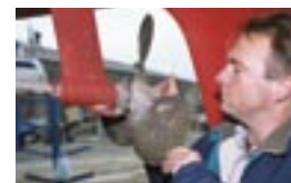
RIGHT: Check for any play in the prop shaft