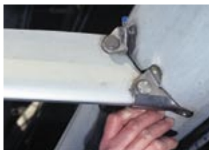
ABOVE: Keep an eye out for wear or cracks. BELOW: Check for chafe on running rigging