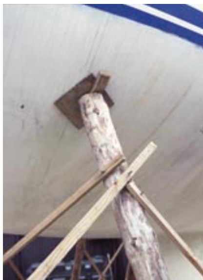
ABOVE: How safe are the shores propping up your boat and those of others nearby? LEFT: Is the outboard due a service? Flush out regardless

Date ON DECK completed: Memos for fitting out/relaunch: