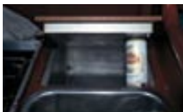
LEFT: Prop the fridge door open and all other lockers to prevent odours