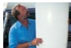
LEFT: Check for any play in your rudder bearing